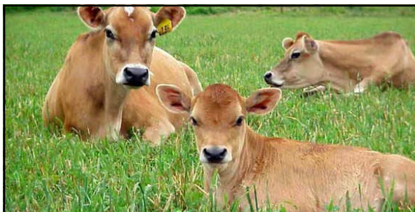
Cows of Bashan (4:1)

God's message to people: repent or perish